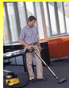
Hotels & restaurants