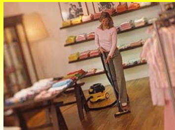
Shops & boutiques