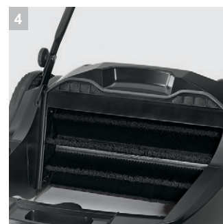
4 Dust filter