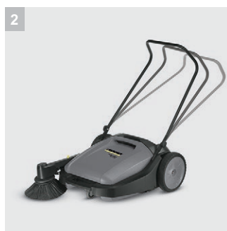
2 Adjustable push handle