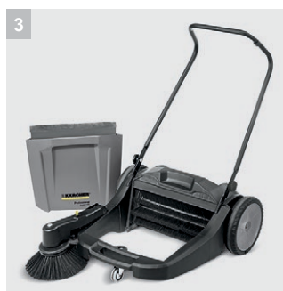
3 Large rubbish bin