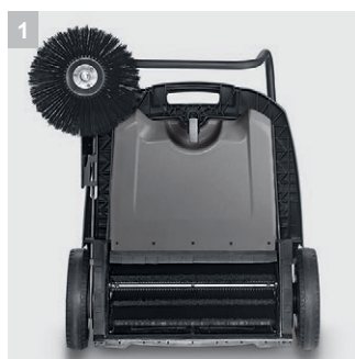
1 Main sweeper roller drive