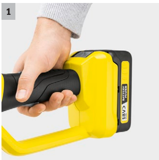
1 18 V Kärcher Battery Power battery platform