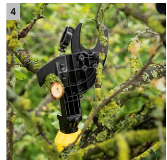
4 Hook acts as a clamp