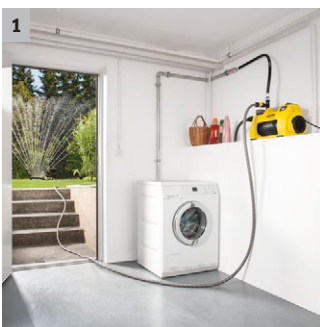
1 Easy to use in the home and garden