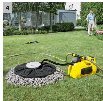
4 Optimal suction