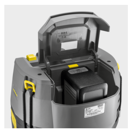
Effective protection cover for the battery bay

• Protects the battery from dirt and moisture. With viewing window.